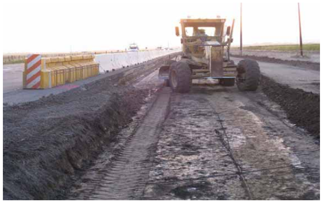
Widening At Shore Rd. Stage 2