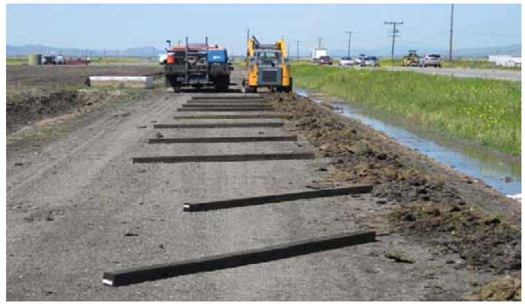
Stage 1 Fence