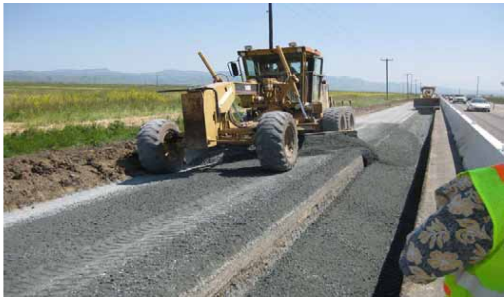
Stage 2 Traveled way section placement of Class 2 Base